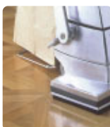
Swirl free sanding for the finest of finishes

Do remember to allow each coat of varnish to dry completely following the manufacturer's instructions, and use Floor Team abrasive pads to sand between each coat of varnish. The fine abrasive pads will remove light